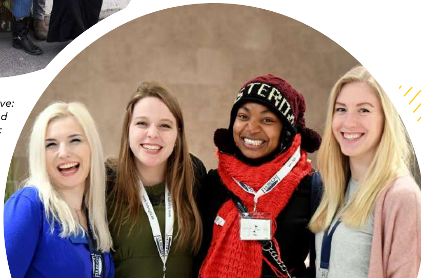
Right: US and German grantees at the Fulbright Berlin Seminar