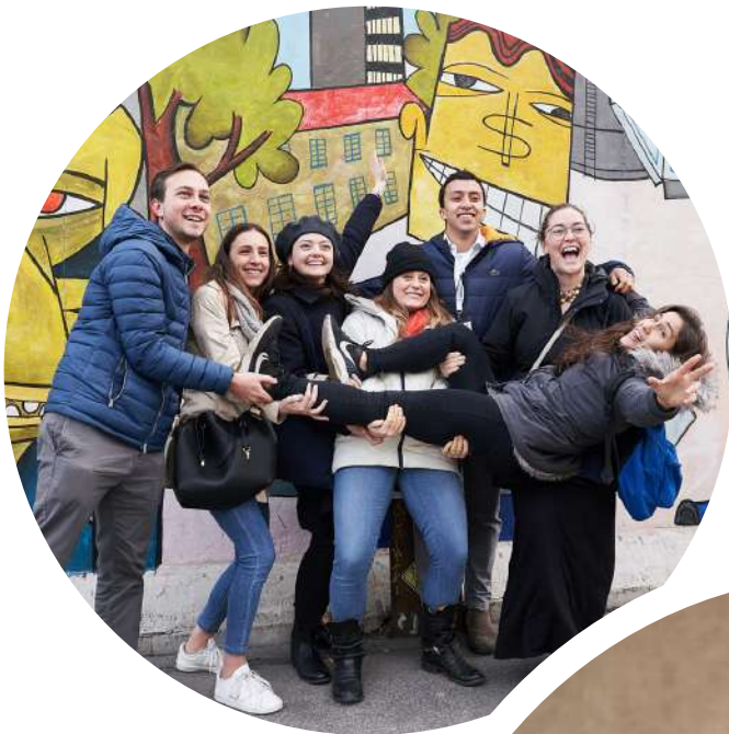
Above: Getting to know the sights and building new networks: Fulbrighters in action

Agile specialist responses to field-driven initiatives — the Specialist Program supports short-term German-American collaborative projects in German higher education. Projects may range from conference cooperation, joint workshops and faculty training to curriculum development and needs assessment. The grant is awarded for a two- to six-week collaborative project at a German higher education institution and has flexible start dates. It covers an honorarium, health/accident insurance, and travel expenses, and is co-financed by the German host institution, which covers the costs for accommodation and meals.